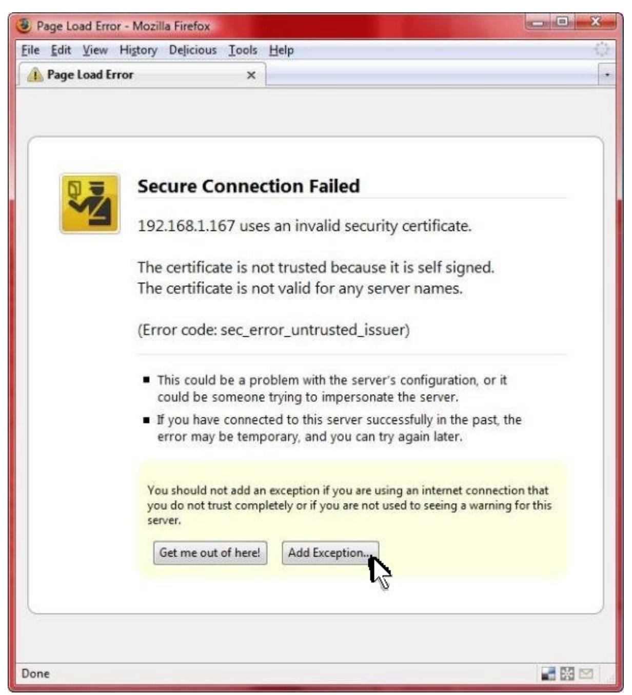
Click the 'Add Exception...' button.