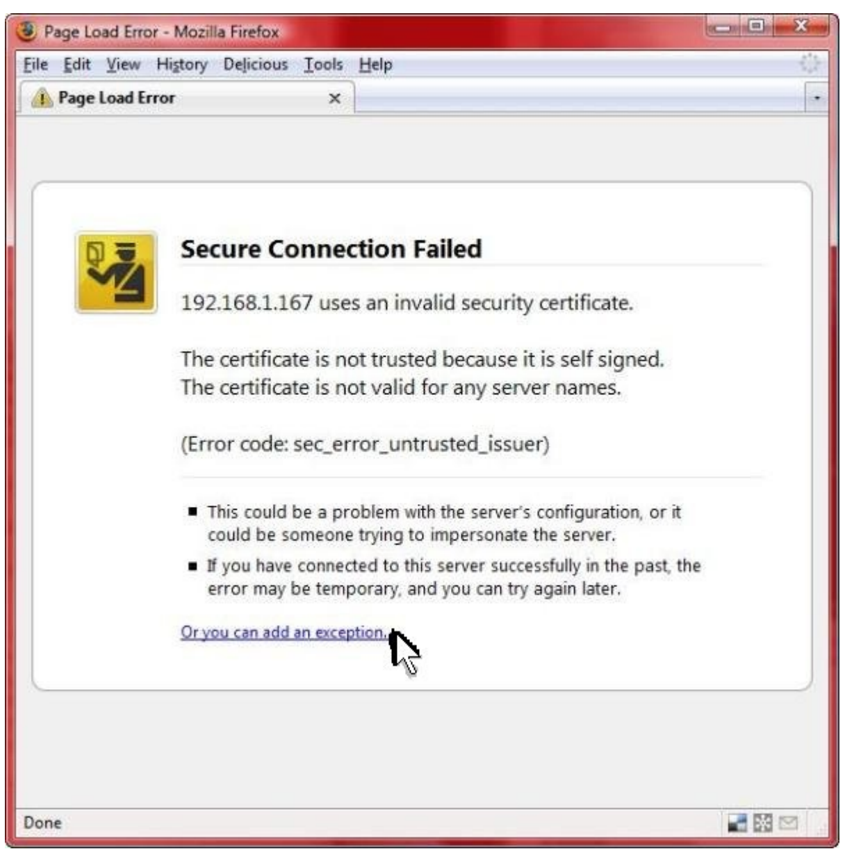
Click 'Or you can add an exception...'.