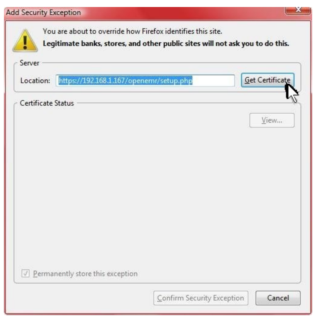
Click the 'Get Certificate' button. (DO NOT edit the 'Location:')